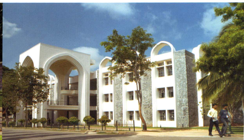
Computer Science Block