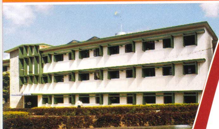
Sir Syed Ahmed Boys Hostel