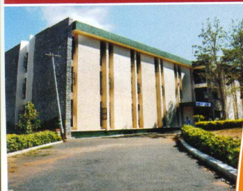
Moulana Azad Boys Hostel