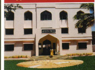
Hazrath Bi Bi Fathima Women's Hostel