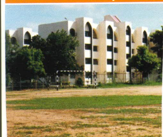
Tippu Sultan Boys Hostel